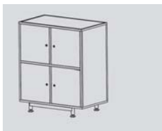
Unit with lock