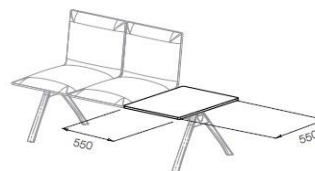
Side Square Table