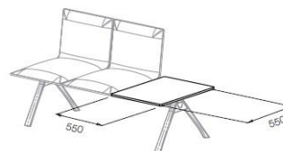
Side Square Table