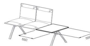
Side Square Table