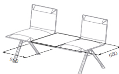
Central Square Table