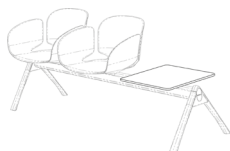
Fixation to floor