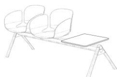
Fixation to floor